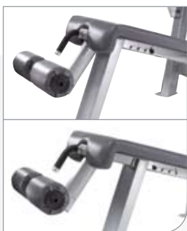
Bench telescopes 6"

Dimensions: 69" W x 66.5" L x 52" H 175.3 W x 168.9 L x 132.1 H cm