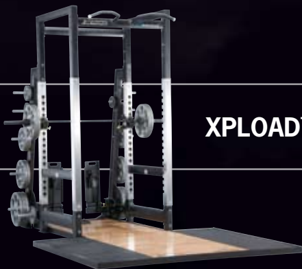
XPLOAD™ Power Rack

Introducing Nautilus® XPLOAD™ professional-grade plate-loaders, racks, platforms, and accessories.