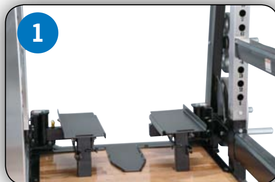
When engaged, our platforms put the spotter in optimal position — no compromises.