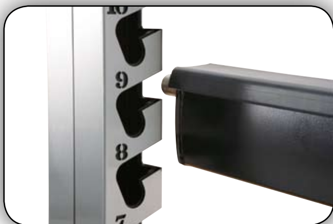
XPLOAD™ safety bars lock into place, firmly and easily.