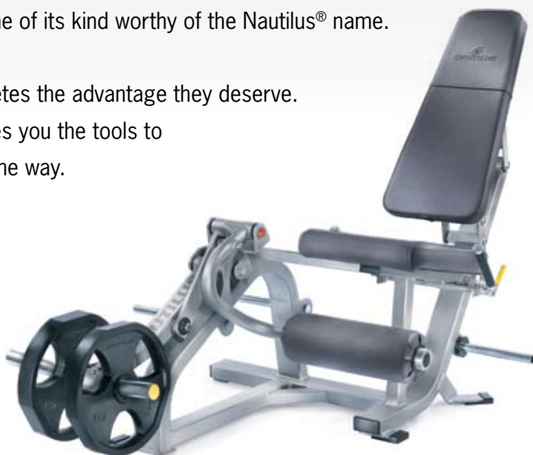
XPLOAD™ Leg Extension

Give your athletes the advantage they deserve. XPLOAD™ gives you the tools to take them all the way.