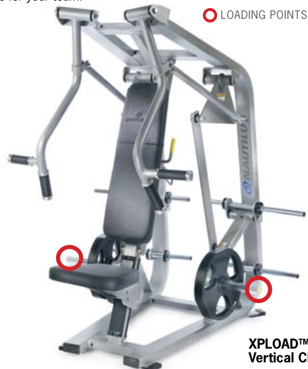
XPLOAD™ Vertical Chest

Load your plates low to the ground. XPLOAD™ machines feature loading points that are low to the ground. No more lifting plates to chest or eye level. Save time, avoid injuries. Save the hard work for the lifter. Another smart detail that makes the XPLOAD™ line the best choice for your team.