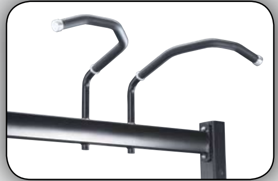
Extended ergo chin bars available on all racks.