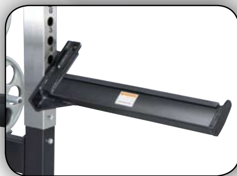
Safety bars twist and lock into place. Easy to adjust, stable when locked in.